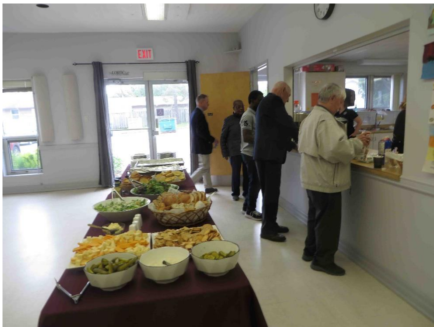
The Main Course of Chicken Parmigiana, etc. Very good!