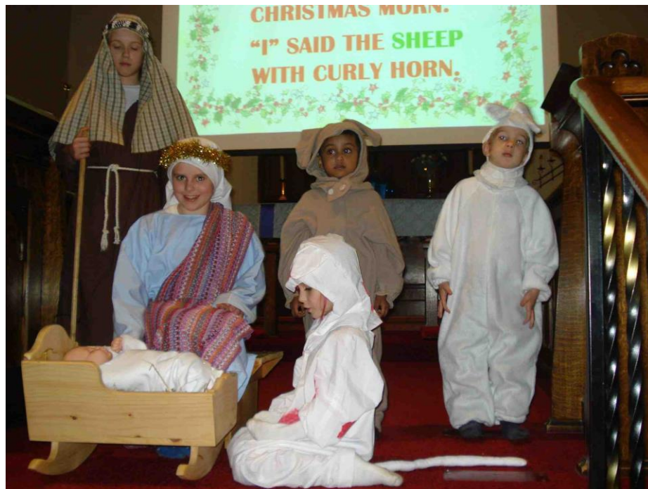
Mary, Jesus' manger and animals