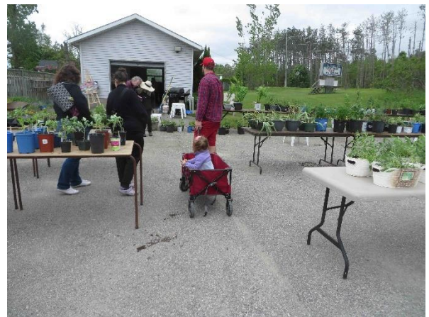
Flowers at the Plant Sale on a cold and windy day