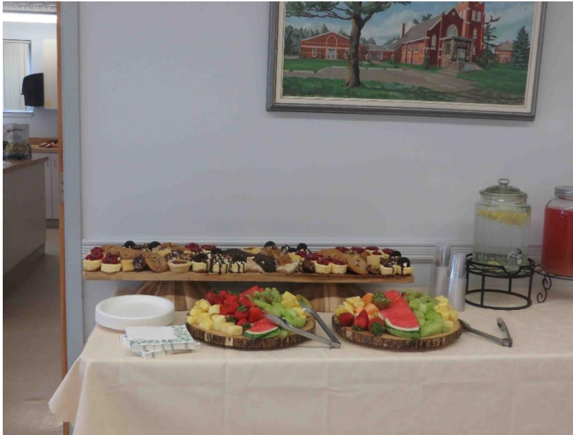
The Desert Table