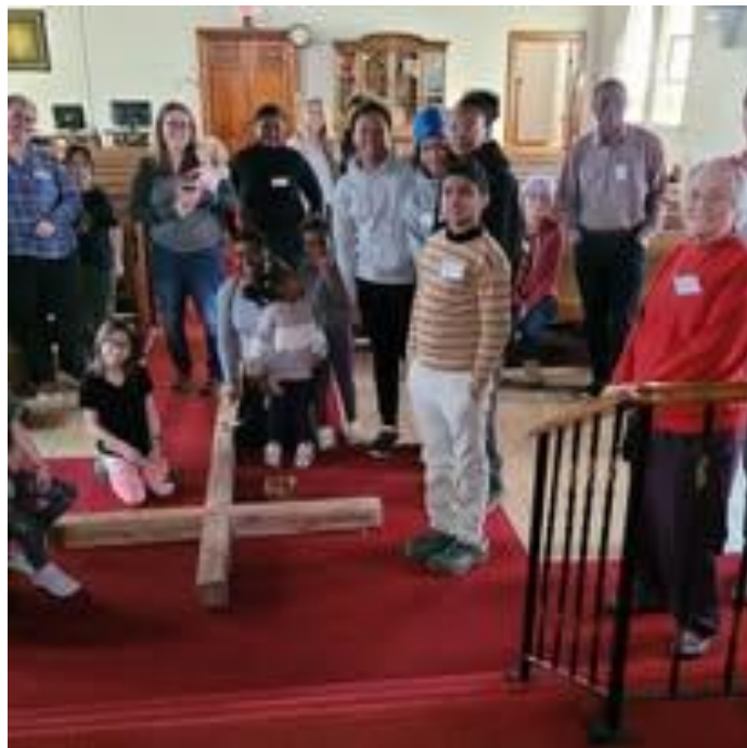
Messy Church Group Photo, Good Friday, 2024