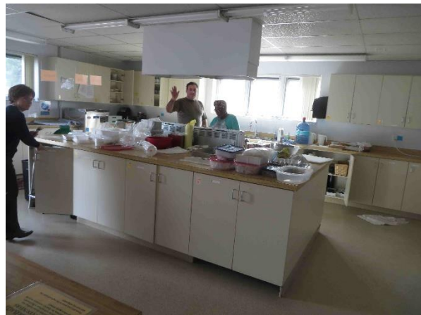
Dinner is Prepared