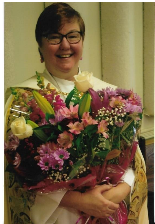
10 th Anniversary at St. Paul's in 2016