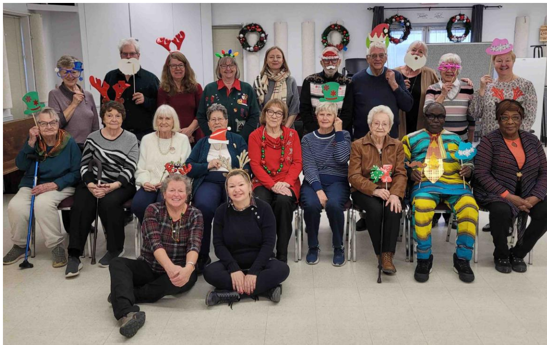
Christmas Tea --group photo of 2024