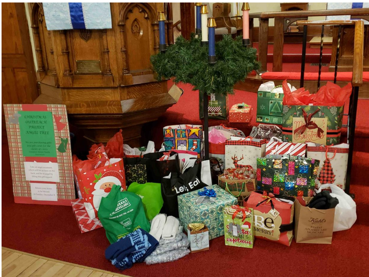
Angel Tree 2019 – Donations received

I am proud of the monies that we have raised and donated to various charities over the last two decades. Soup lunches to our Angel Tree, we have supported The Busby Center, Barrie Food Bank, CMHA, and Youth Haven to name a few. We sent Children's Ministry resources to Yellowknife, medication to Venezuela, sweaters to Syria, eye glasses to Kenya and supported disaster relief through PWRDF.