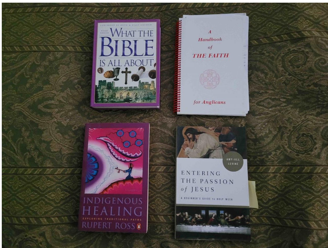
Some of the books used for Adult Education