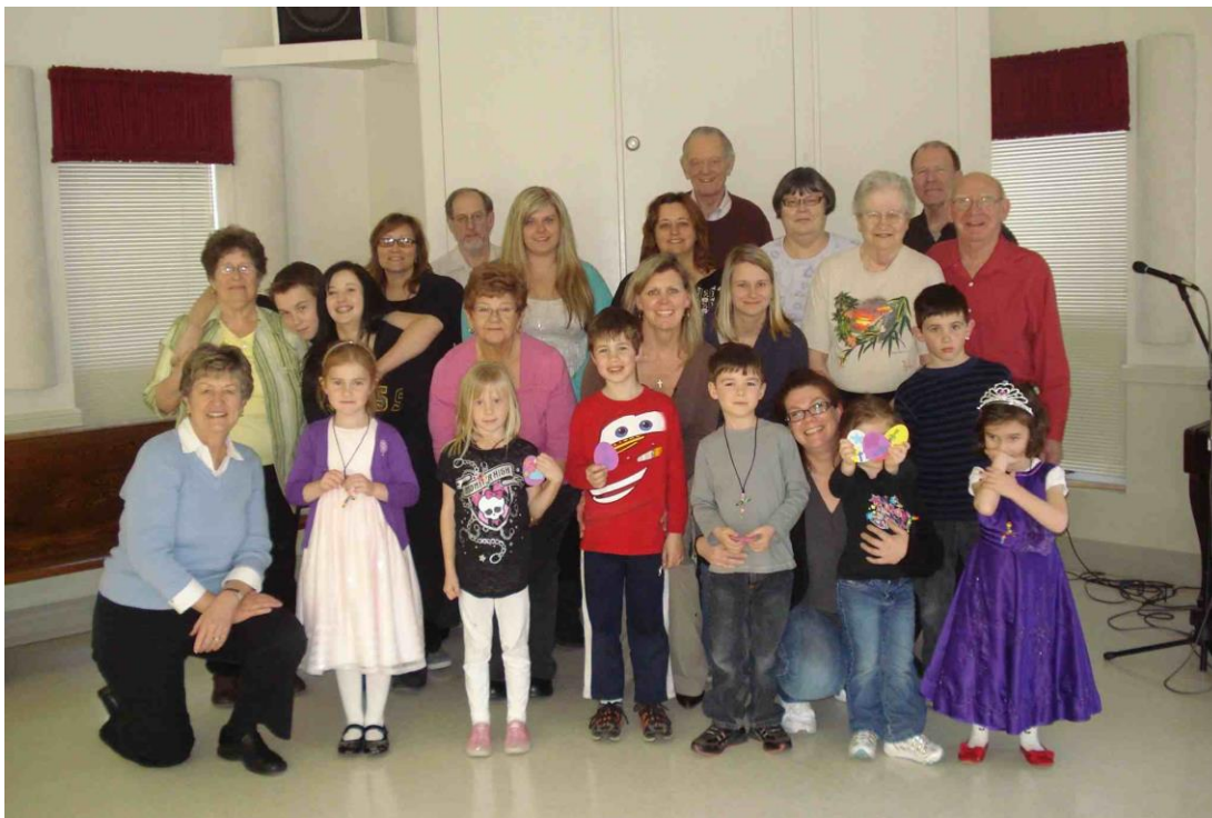
Messy Church Group Photo, 2012