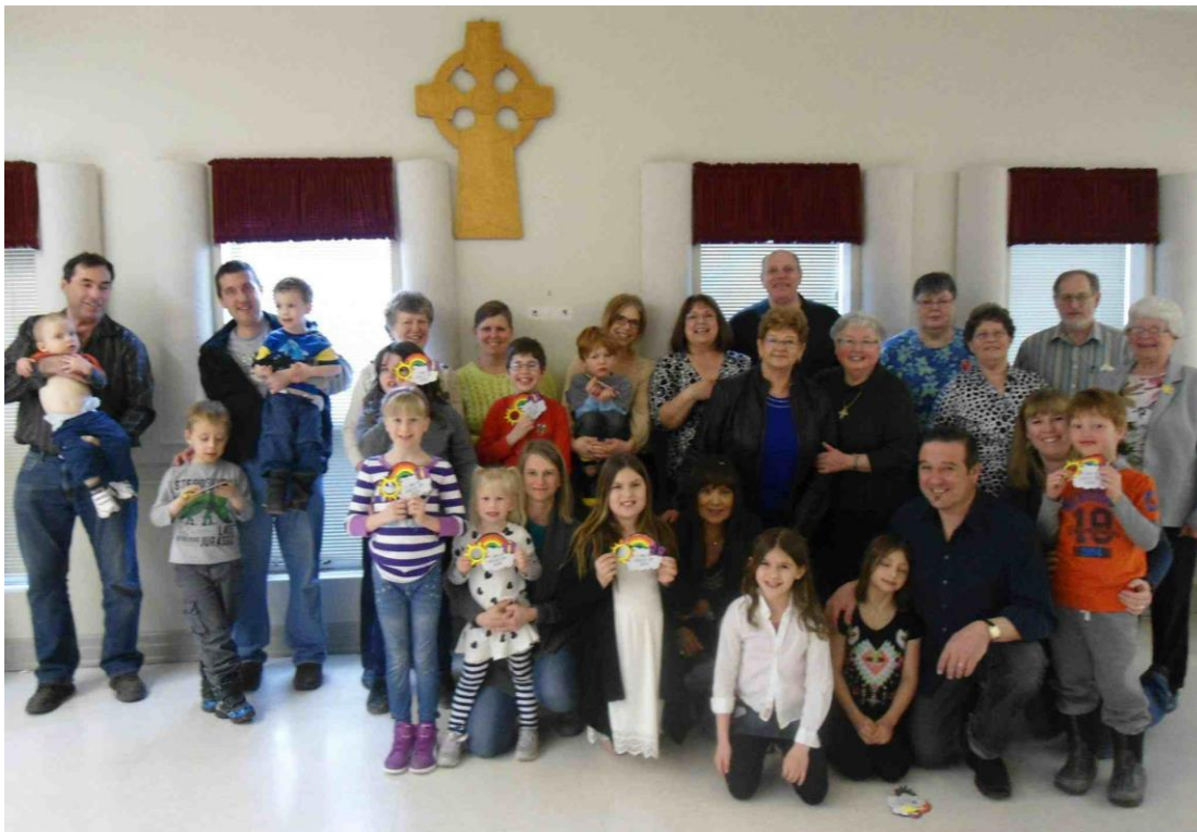
Messy Church Group Photo, 2013

I channeled my inner grandma creating crafts for Messy Church, our Jesus Party, and our Deep Blue Sunday School curriculum. We had Pioneer Club afterschool on Wednesday. We had end of Sunday School/June picnics with informal worship. And during my almost twenty years with you, three times we had a large Sunday School and 'tween youth group.