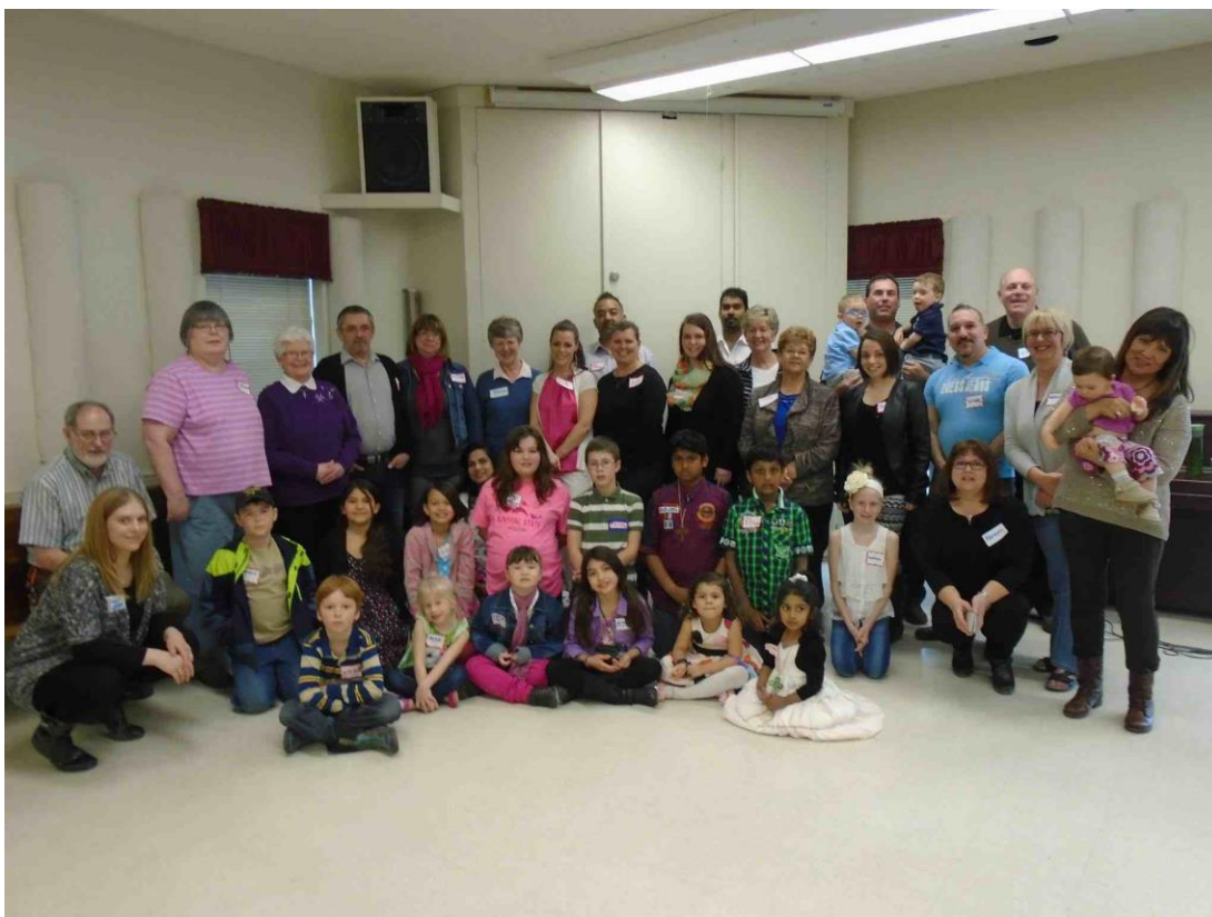
Messy Church Group Photo, 2015