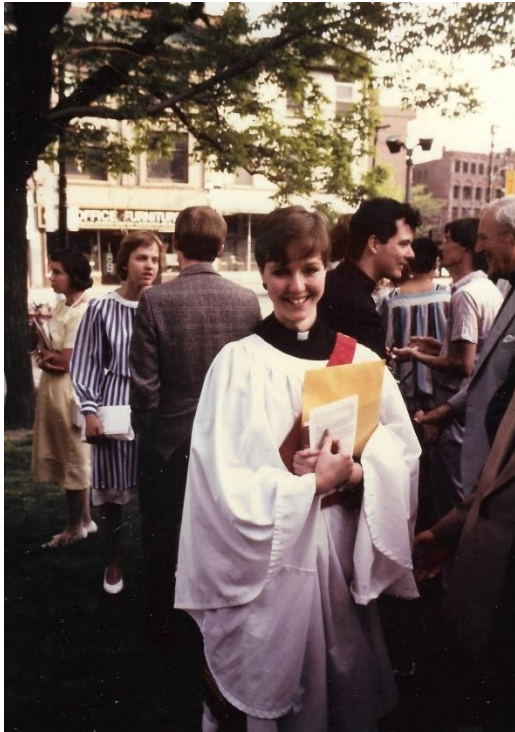
Ordination to the Diaconate at St. James, 1987

I grew up as a “cradle Anglican” and the parish church was always a loving community for my family. I am blessed to have always known Jesus and was taught to worship, pray and learn. I have included the photograph of me when I was ordained to the diaconate in 1987 and then one of me on my tenth anniversary as your Incumbent. Life-changing for me was meeting my