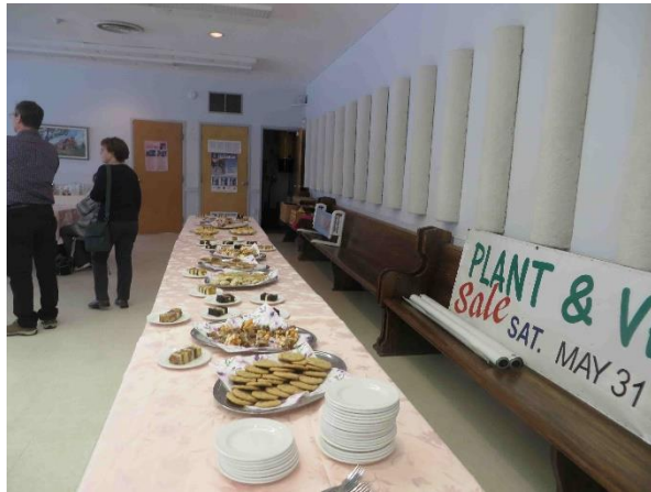
The Dessert Table