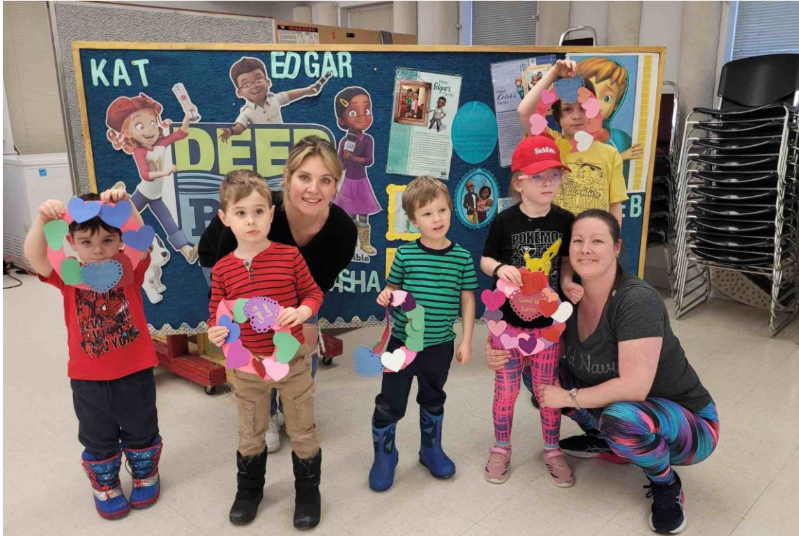
Messy Church Group Photo, Valentines, 2023