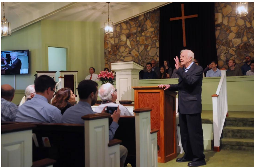
Left: Carter speaks to the congregation at Maranatha Baptist Church before teaching Sunday school in his hometown of Plains, Georgia, in 2019.

That’s because during the 19th century, White evangelicals led the way on social justice issues. Evangelical leaders, like Charles Finney, fought against slavery, were active in prison reform, led peace crusades and were crucial in forming public schools to help less affluent children gain social mobility.