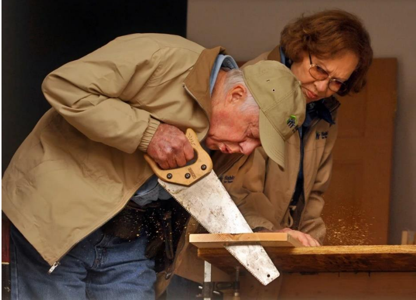
Left: Former President Jimmy Carter and his wife, Rosalynn work on building houses for the needy in Baltimore, Maryland on October 5, 2010, as part of a weeklong nationwide project with Habitat for Humanity.