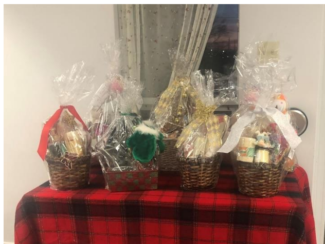
Gift Baskets Table