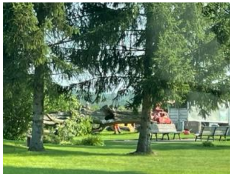
Tombstone and tree damage in the cemetery. Roof lifted in the NW corner of the roof (white spots above scaffolding).