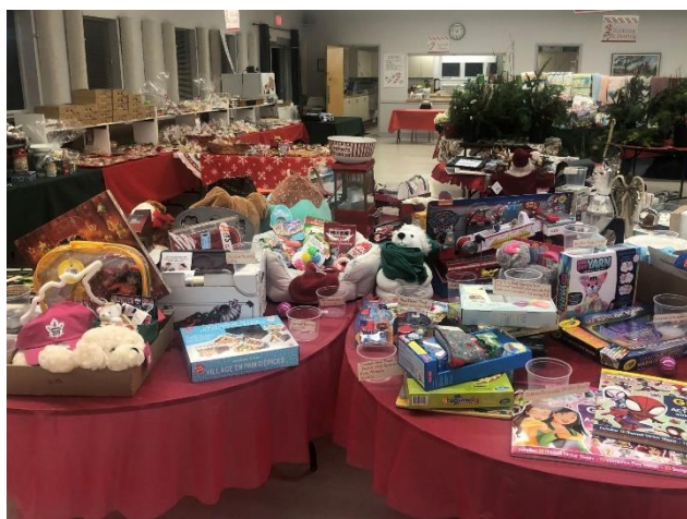
The Penny Tables