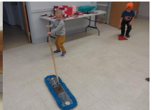
Decorating the cup cakes and the ultimate fate of one! Followed by the clean-up crew!