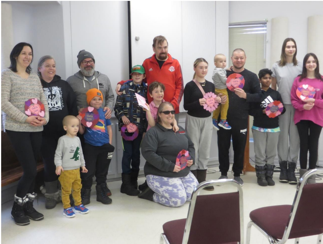
The Group in attendance.