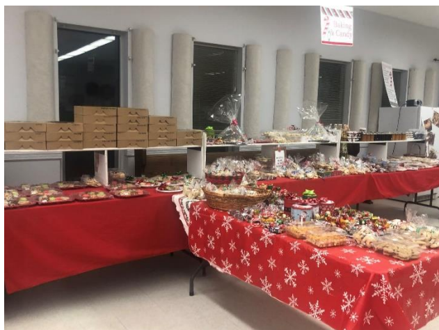
The Bake Table

All pictures taken before the bazaar opened to the public.